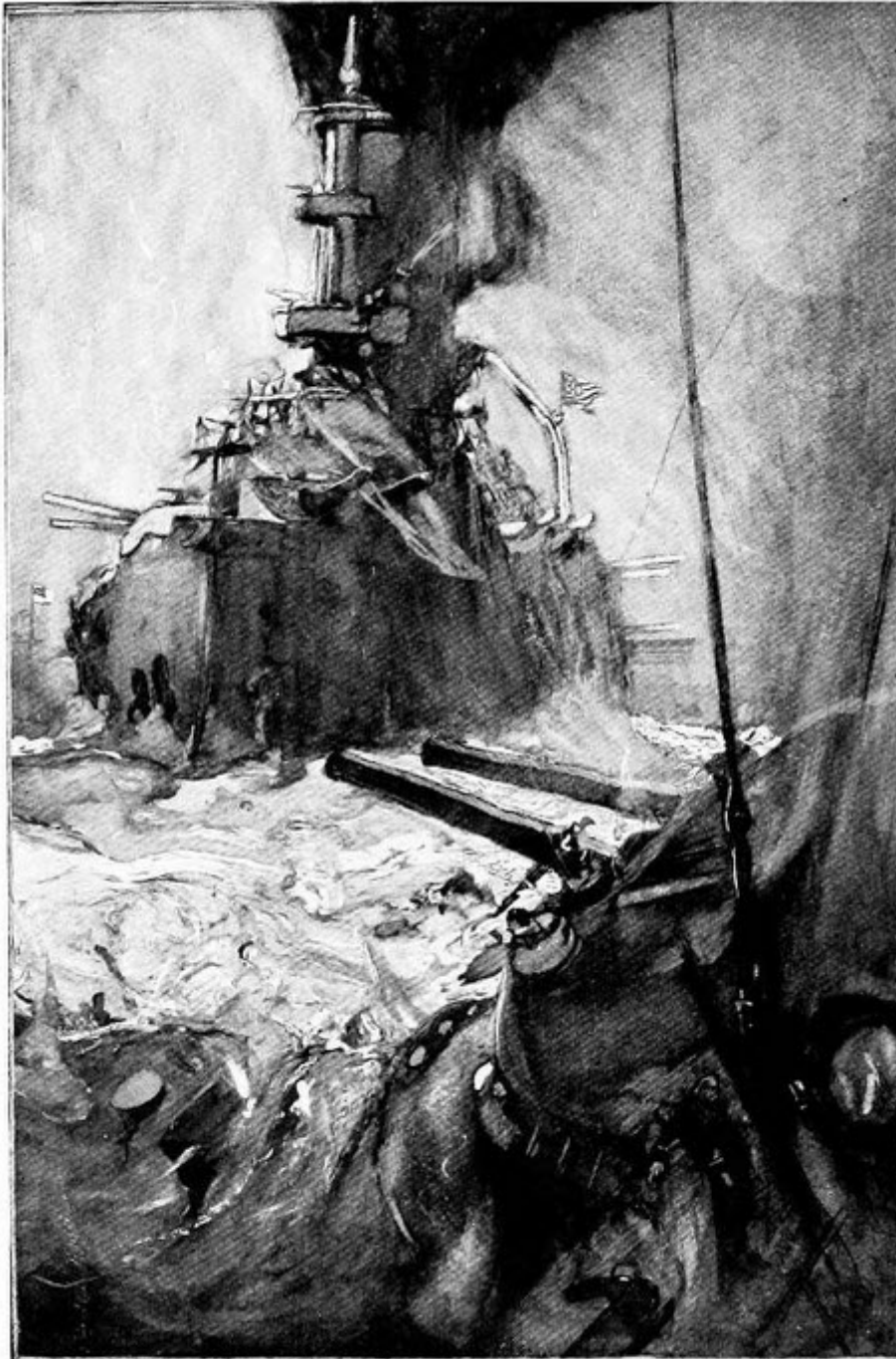
“The Arizona was gliding toward the shattered, massive wreck.”